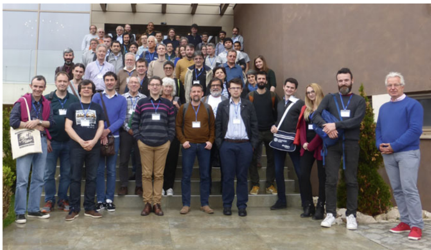
Fig. 3. Group photo of the conference