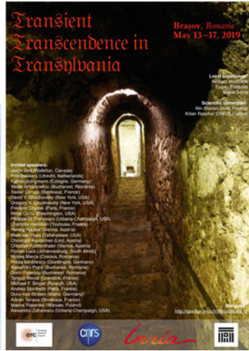
Fig. 2. Posters of the conference (Bran castle)